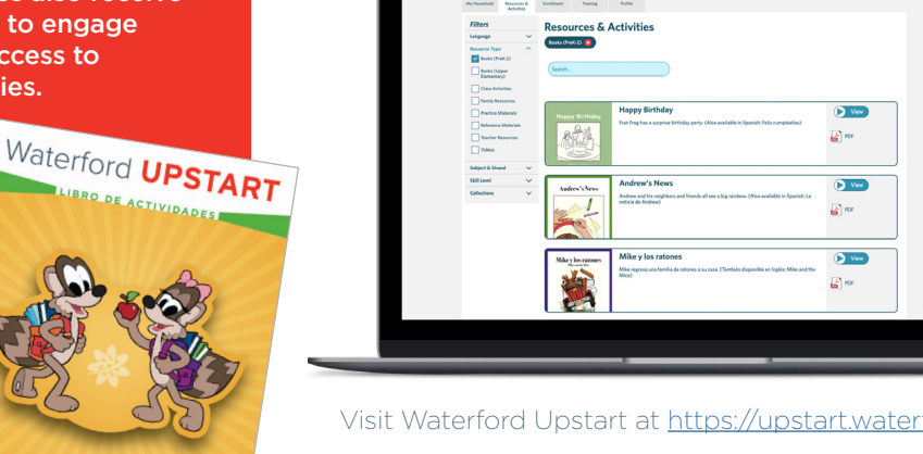
Visit Waterford Upstart at <a href="https://upstart.waterford.org/">https://upstart.waterford.org/</a>

The Waterford Upstart Activity Books are available to many families. These books include resources designed specifically for young children as well as family activities for reading, writing, math, and science. All activities in the Waterford Upstart Activity Book are avaliable online at Waterford Upstart.